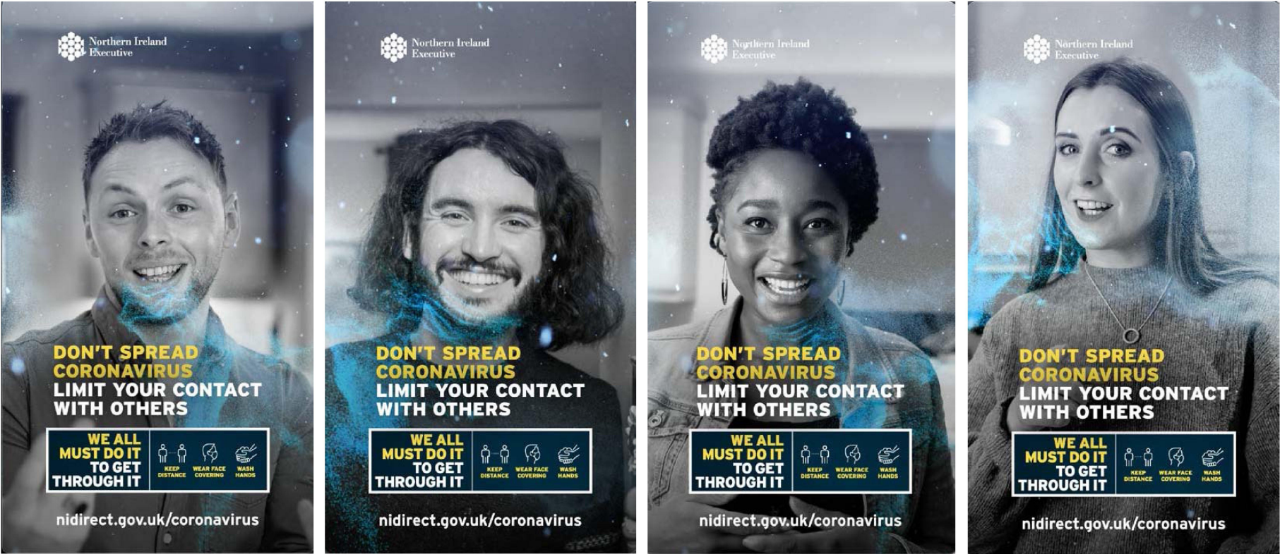
DIGITAL 6 SHEETS