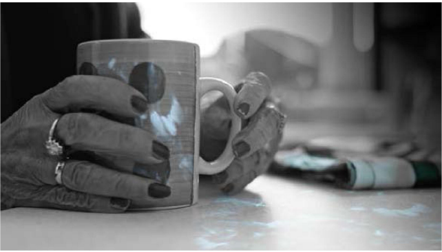
DON'T PASS IT ON 30s TV