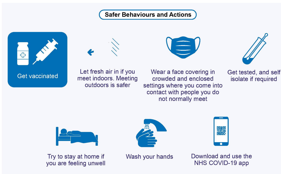
Figure 2: Safer Behaviours and Actions