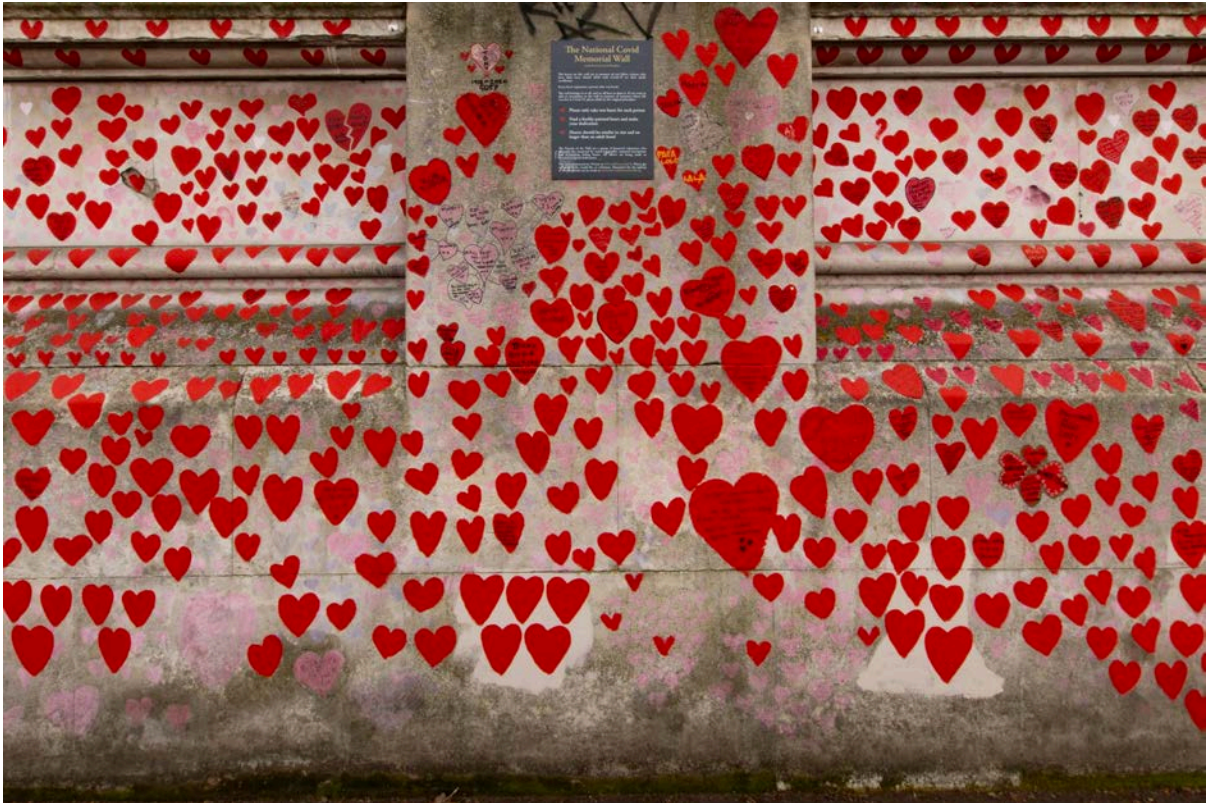
Above: Image of the National Covid Memorial Wall in London.