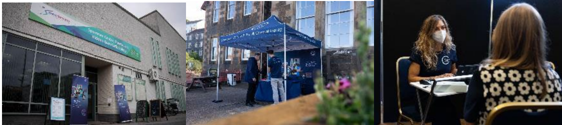
Above, left to right: outside our Every Story Matters event at the Spectrum Centre, Inverness; speaking to members of the public at our pop-up stand at the Rockfield Centre, Oban; listening to members of the public at our recent events

We are very grateful for the support from these organisations and all those who took the time to speak with us at our events.