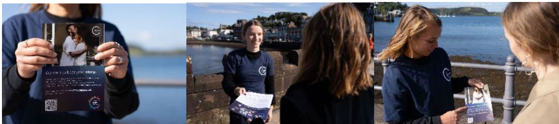
Below: sharing information about Every Story Matters with local people in Oban