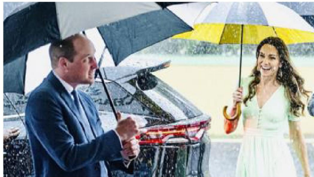
Showers, shopping and soccer: The best of British press photography