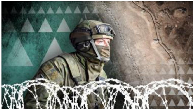
Satellites reveal Russian defences before major assault