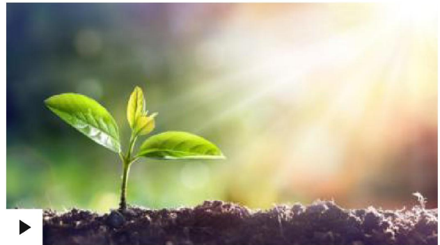
Can saving languages save nature?