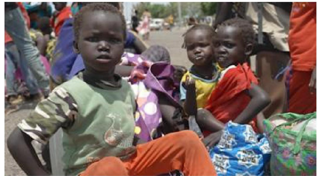
Waiting at the airport with nowhere to go