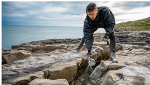
Artist unveils dinosaur art for new Apple series