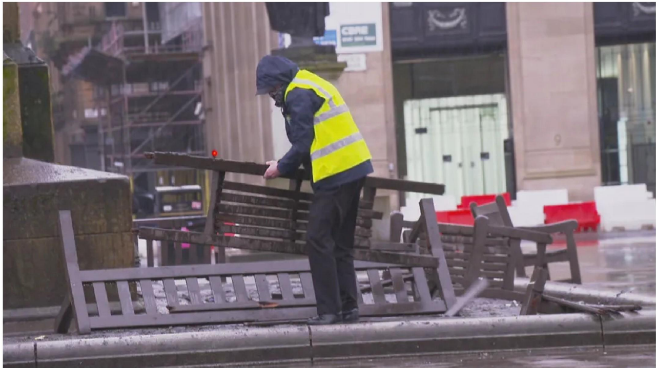
Benches were broken in George Square during the celebrations

Glasgow City Council said a number of memorial benches donated by grieving relatives were damaged in George Square, and that it was working to trace the families.