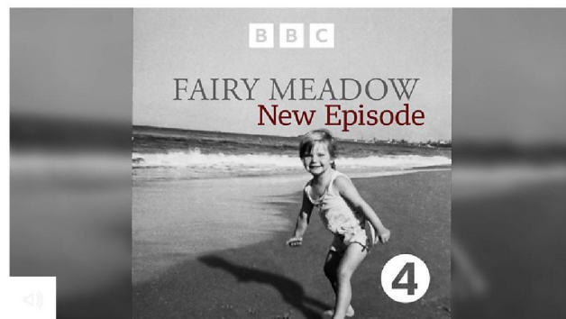
A new lead in Cheryl Grimmer's case