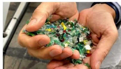
The T-shirt chewing enzyme ready to tackle plastic waste