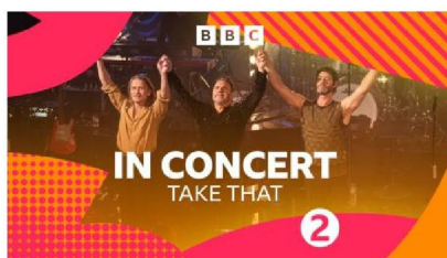
A concert you'll never forget...

Take That perform a special gig filled with tracks from their new album, This Life, and their biggest hits too!