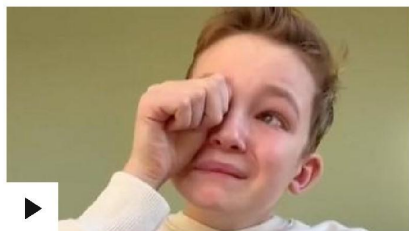
Watch: Boy's tearful thanks after leukaemia all-clear