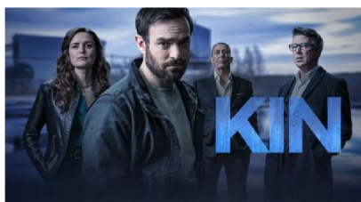
A Dublin crime family face a gangland war

Outnumbered and outgunned - will bonds of blood win out?