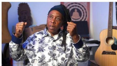
When sea levels rise, so does your rent