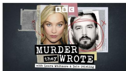
A compelling journey through the craziest crimes...

The world's most jaw-dropping crime stories with Laura Whitmore and Iain Stirling