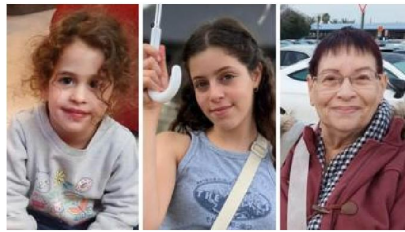
Who are the released hostages?