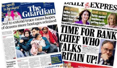
The Papers: Gaza truce 'hopes' and Bank chief 'talks UK down'