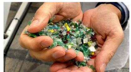
The T-shirt chewing enzyme ready to tackle plastic waste