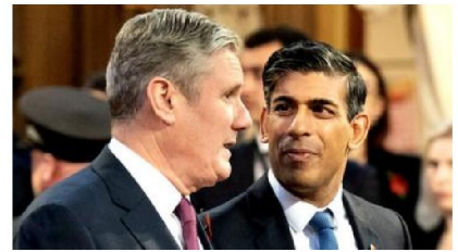
Chris Mason: Sculptures row about politics as much as history