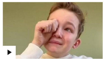
Watch: Boy's tearful thanks after leukaemia all-clear