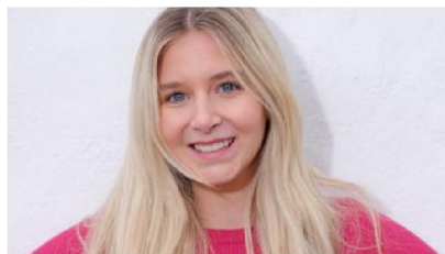
The English town with a curious Canadian corner