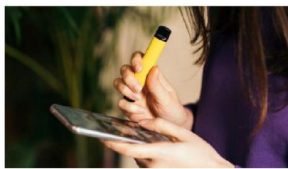
How can we stop children vaping?