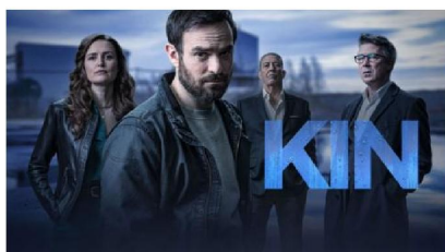
A Dublin crime family face a gangland war

Outnumbered and outgunned - will bonds of blood win out?