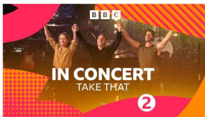
A concert you'll never forget...

Take That perform a special gig filled with tracks from their new album, This Life, and their biggest hits too!