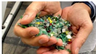
The T-shirt chewing enzyme ready to tackle plastic waste