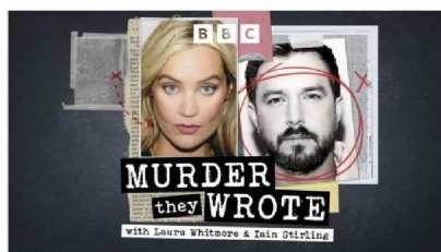
A compelling journey through the craziest crimes...

The world's most jaw-dropping crime stories with Laura Whitmore and Iain Stirling