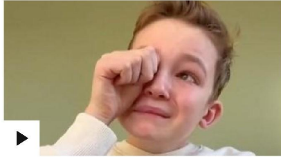
Watch: Boy's tearful thanks after leukaemia all-clear