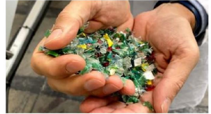
The T-shirt chewing enzyme ready to tackle plastic waste