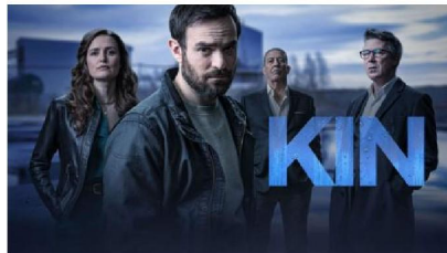
A Dublin crime family face a gangland war

Outnumbered and outgunned - will bonds of blood win out?