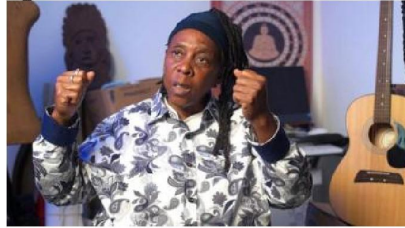
When sea levels rise, so does your rent