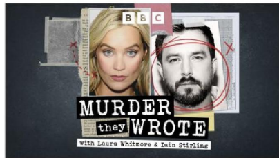
A compelling journey through the craziest crimes...

The world's most jaw-dropping crime stories with Laura Whitmore and Iain Stirling