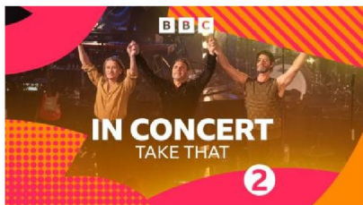
A concert you'll never forget...

Take That perform a special gig filled with tracks from their new album, This Life, and their biggest hits too!