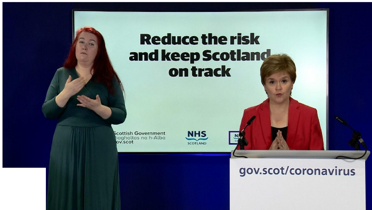
| Covid in Scotland: 'Cases have roughly doubled in a week'

Scotland has recorded a record number of daily Covid cases as the number surged above 6,000 for the first time.