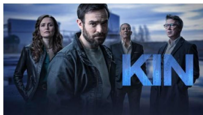
A Dublin crime family face a gangland war Outnumbered and outgunned - will bonds of blood win out?