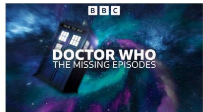
The pictures might be lost in time, but the sound lives on!