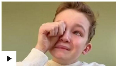
Watch: Boy's tearful thanks after leukaemia all-clear