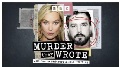
A compelling journey through the craziest crimes...