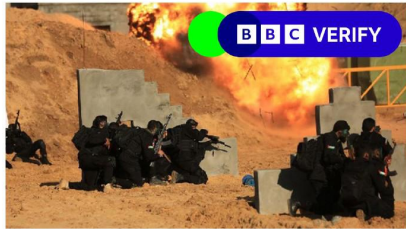
How Hamas built a force to attack Israel on 7 October