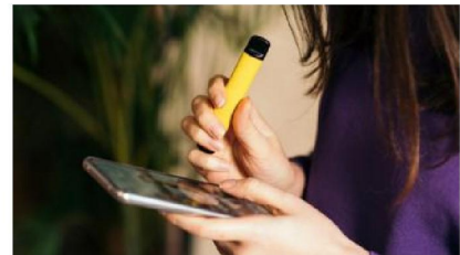
How can we stop children vaping?