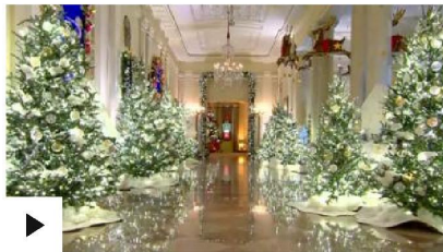
Ninety-eight trees and a gingerbread White House