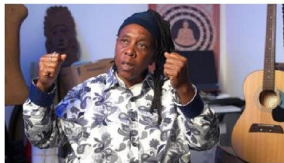
When sea levels rise, so does your rent