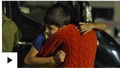
Watch: Released 12-year-old hostage hugs mum