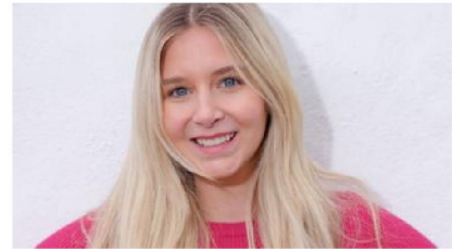
The English town with a curious Canadian corner