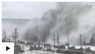
Watch: Huge waves hit Russian coast in Winter storms