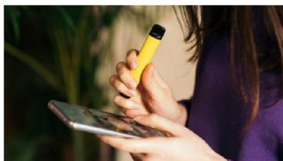
How can we stop children vaping?