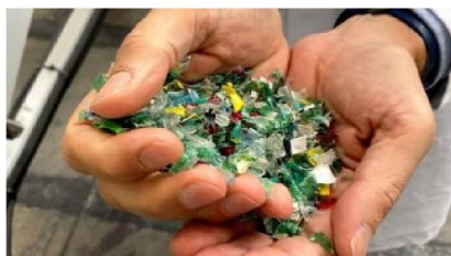
The T-shirt chewing enzyme ready to tackle plastic waste