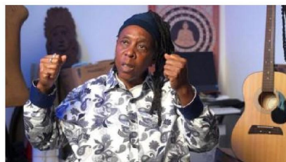
When sea levels rise, so does your rent