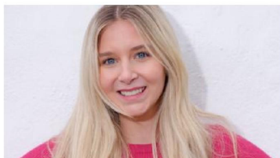
The English town with a curious Canadian corner