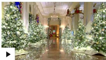
Ninety-eight trees and a gingerbread White House