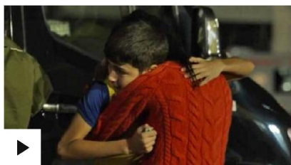
Watch: Released 12-year-old hostage hugs mum