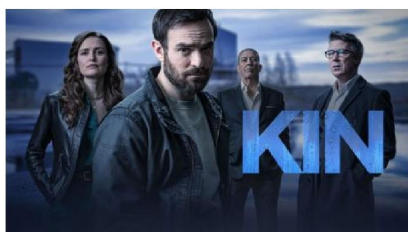
A Dublin crime family face a gangland war Outnumbered and outgunned - will bonds of blood win out?