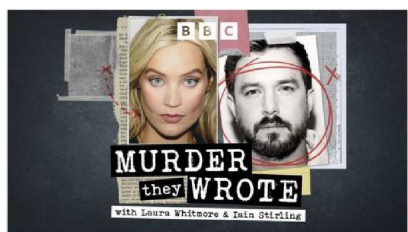
A compelling journey through the craziest crimes...