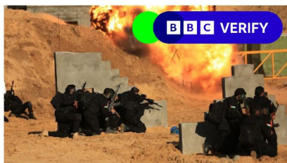
How Hamas built a force to attack Israel on 7 October