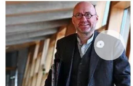
All homes in Scotland must meet new energy efficient standard 2033, Patrick Harvie announces