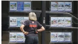
Scots tenants face 'astronomical' rent increases while landlords rake in 'huge profits'