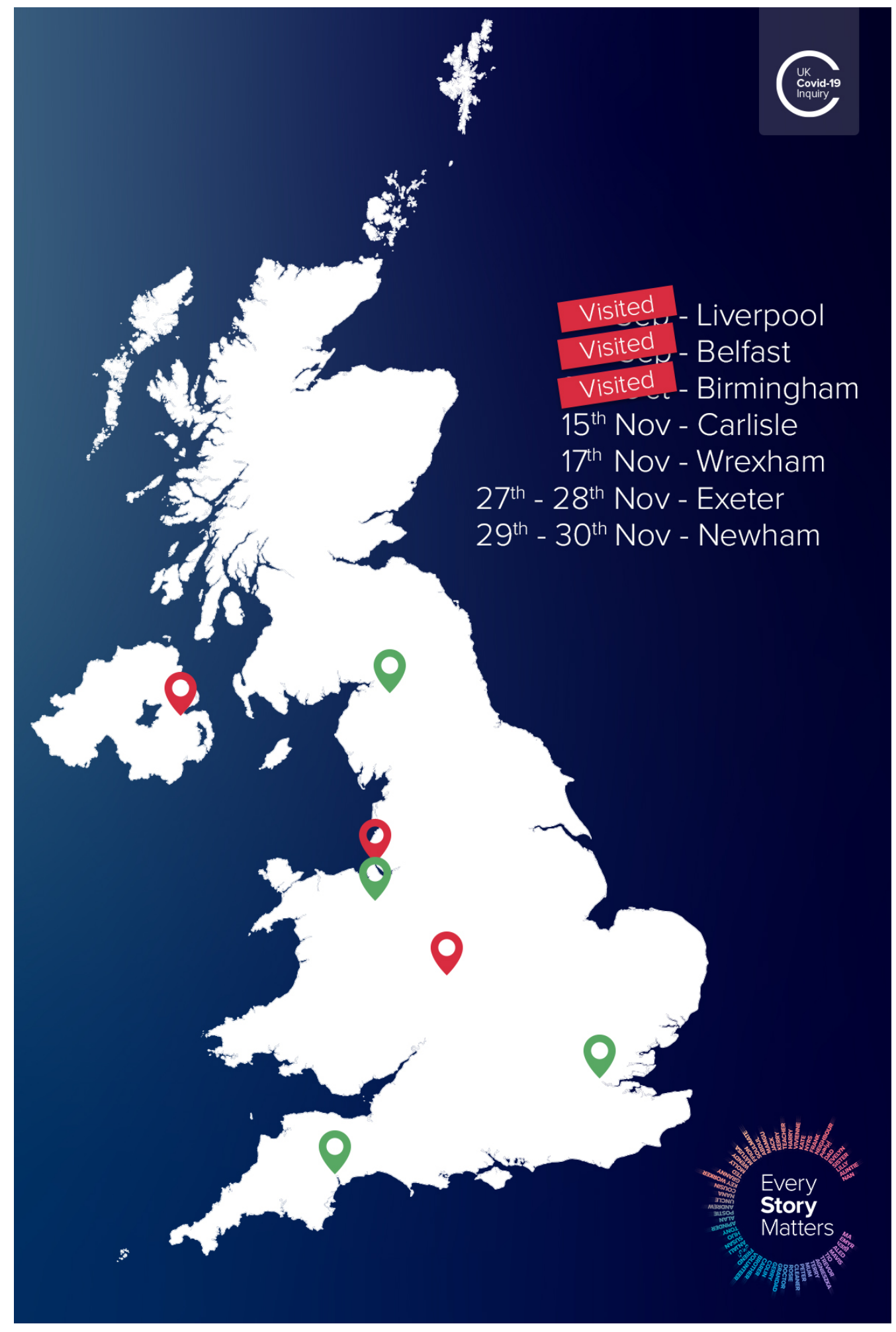
Every Story Matters events are a way of sharing your story with the Inquiry in person. Some of these events are targeted for specific groups of people affected by the pandemic, while others are